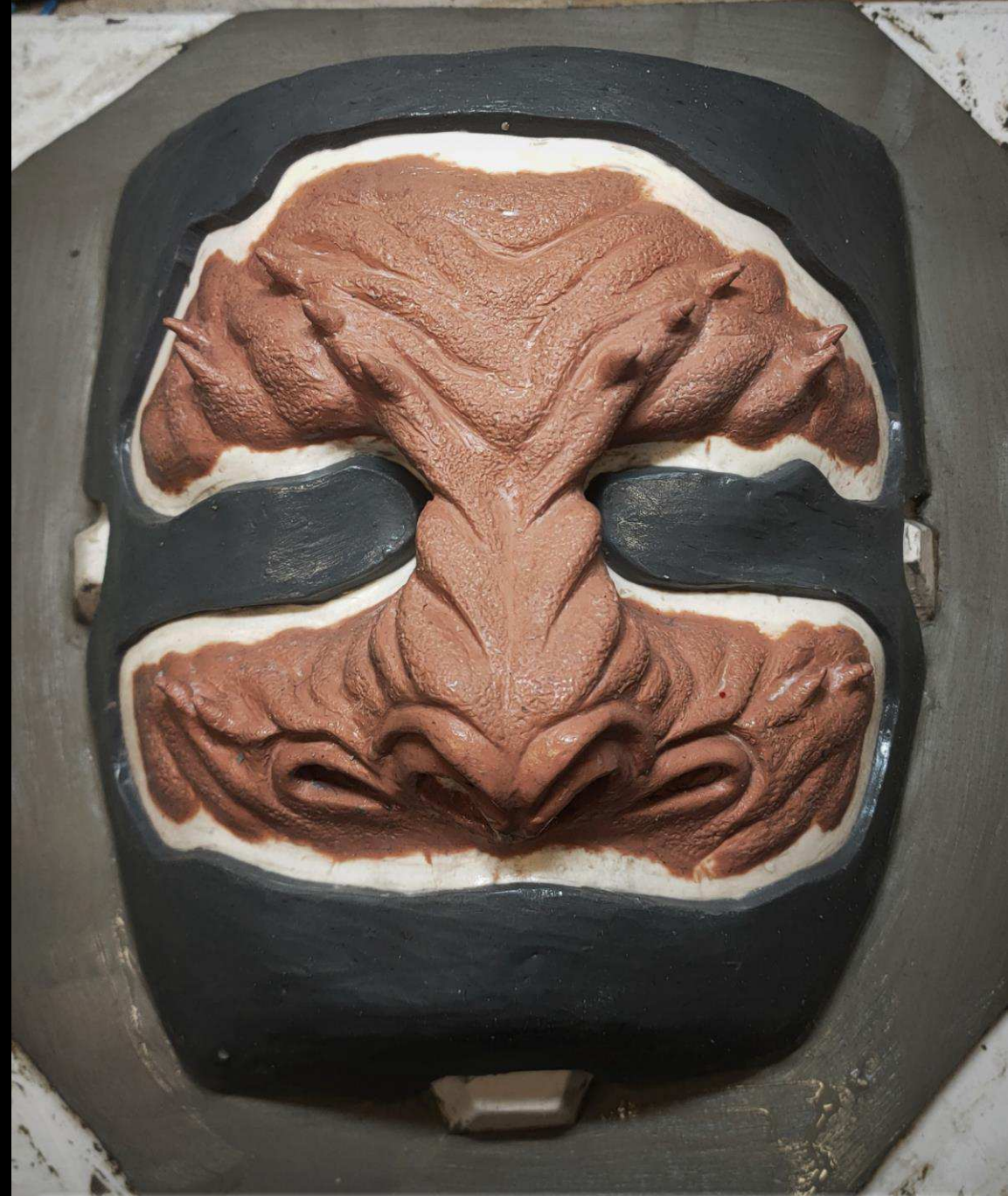
Silicone creature sculpt for the prosthetics event 2022