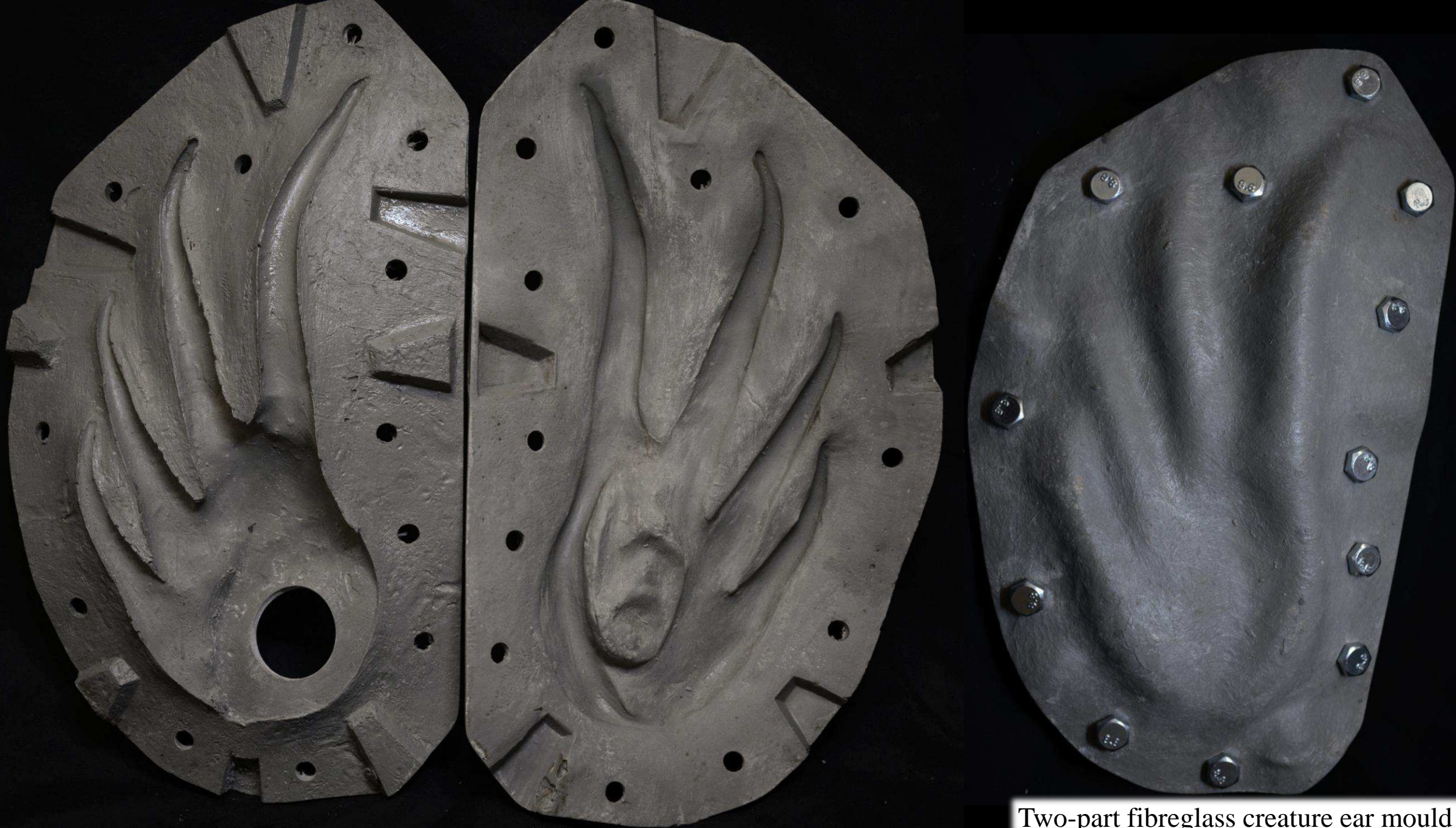
Two-part fibreglass creature ear mould