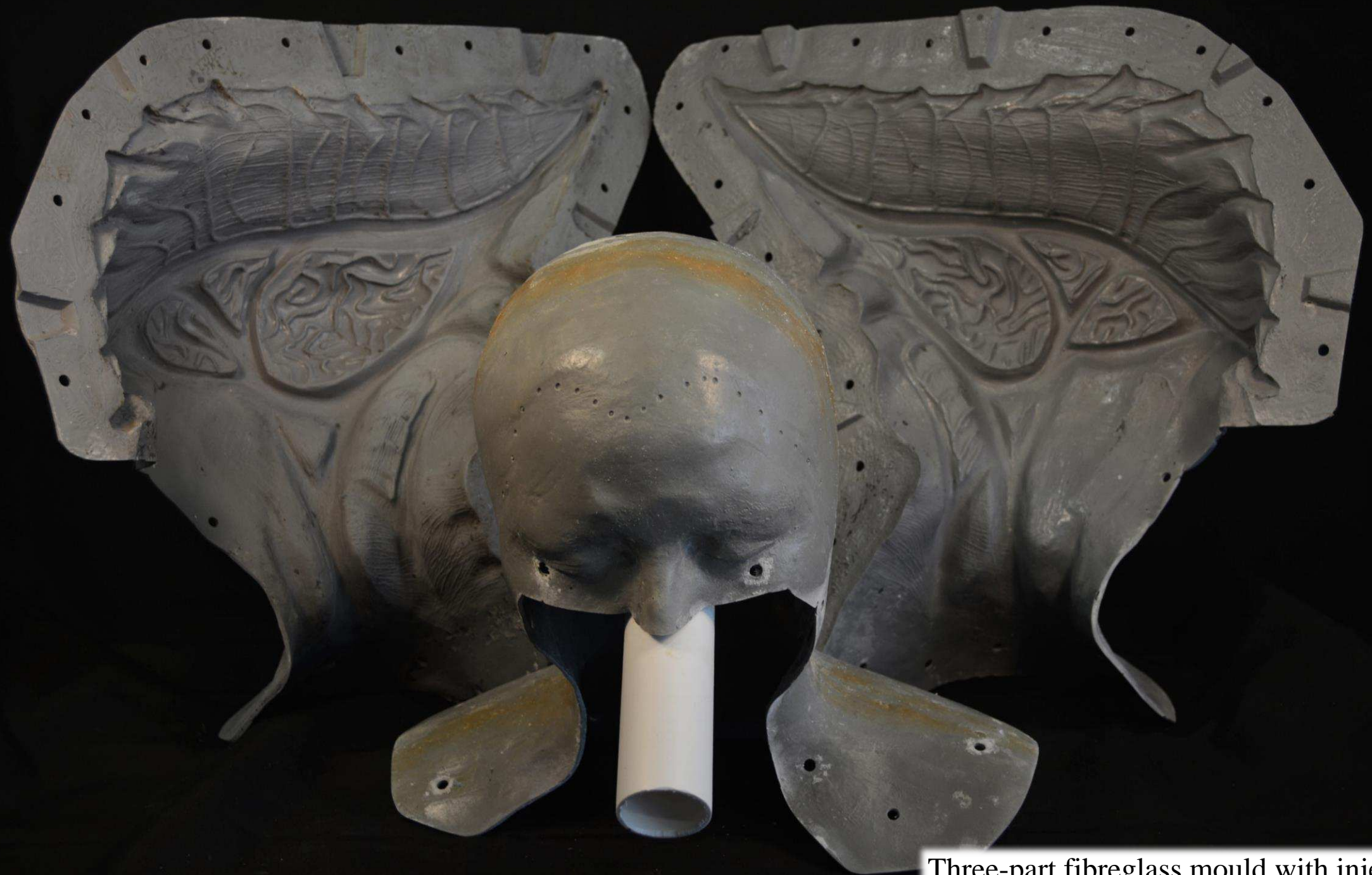
Three-part fibreglass mould with injection hole