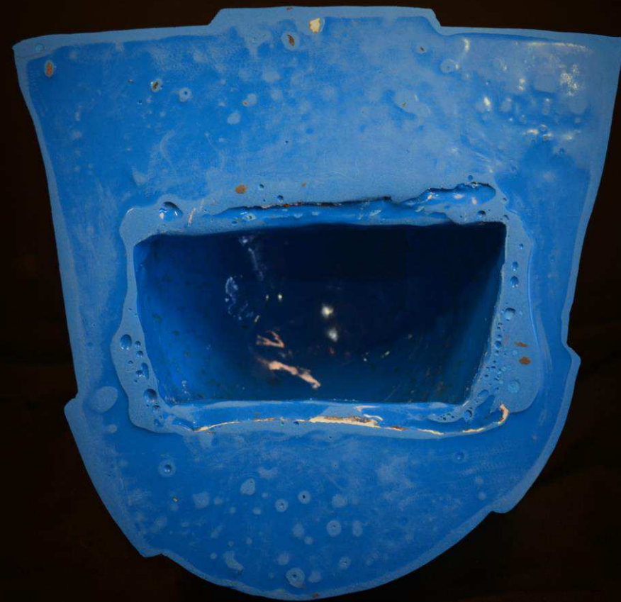
Axson F40 mould and core with built-in handle