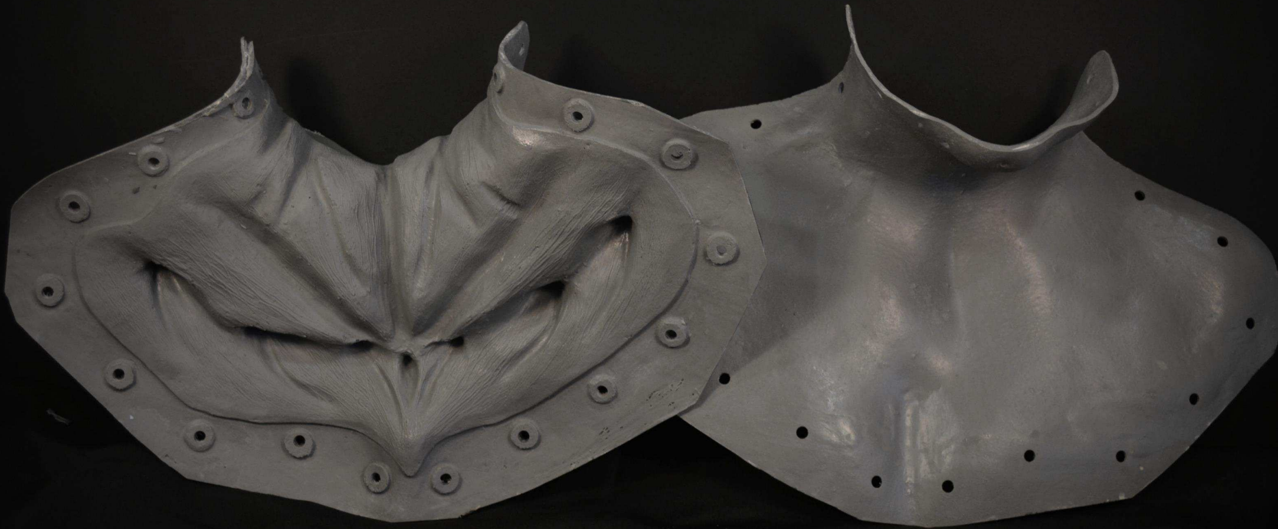
Two-part fiberglass neck mould