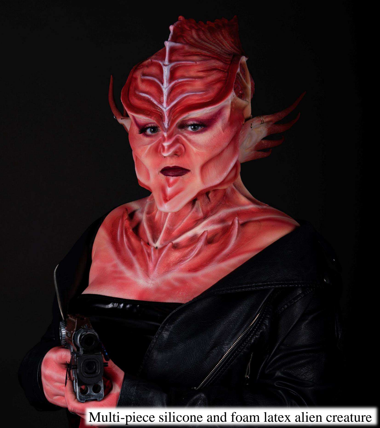
Multi-piece silicone and foam latex alien creature