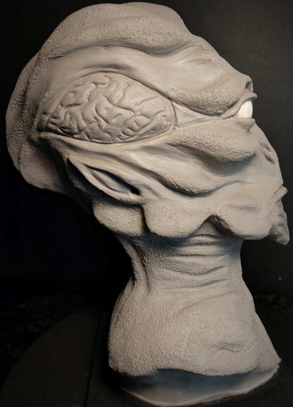
Buff clay alien puppet sculpture