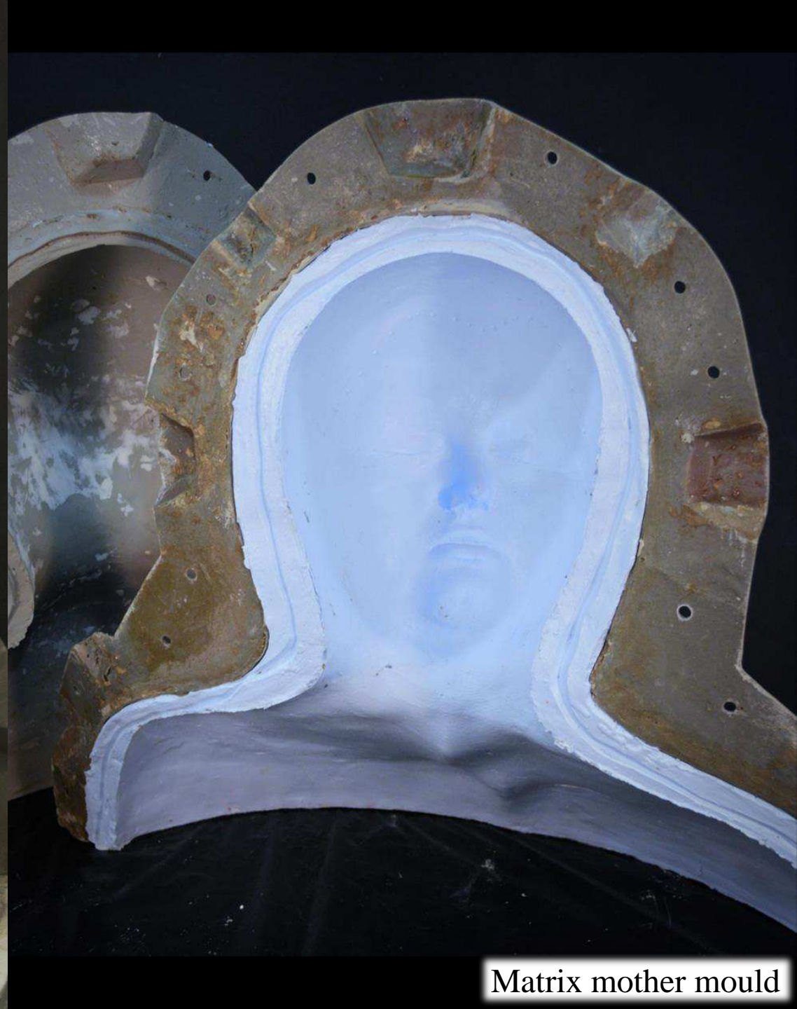
Matrix mother mould