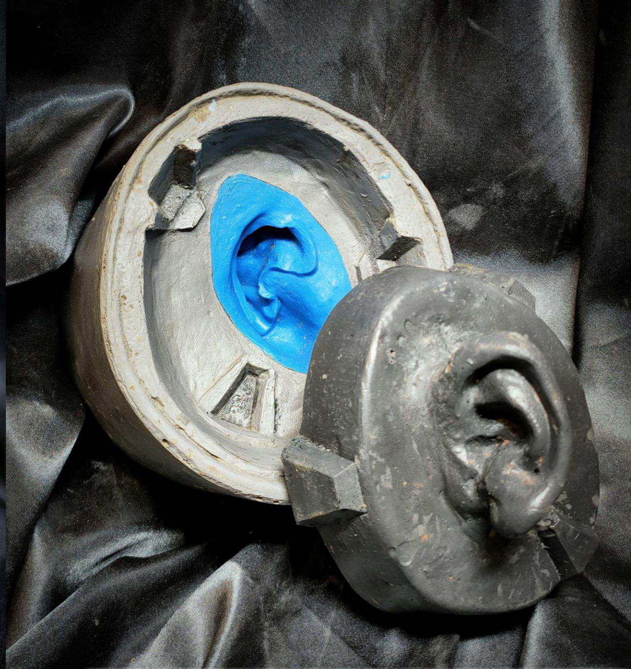
Ear sculpture and mould for the prosthetics event 2022