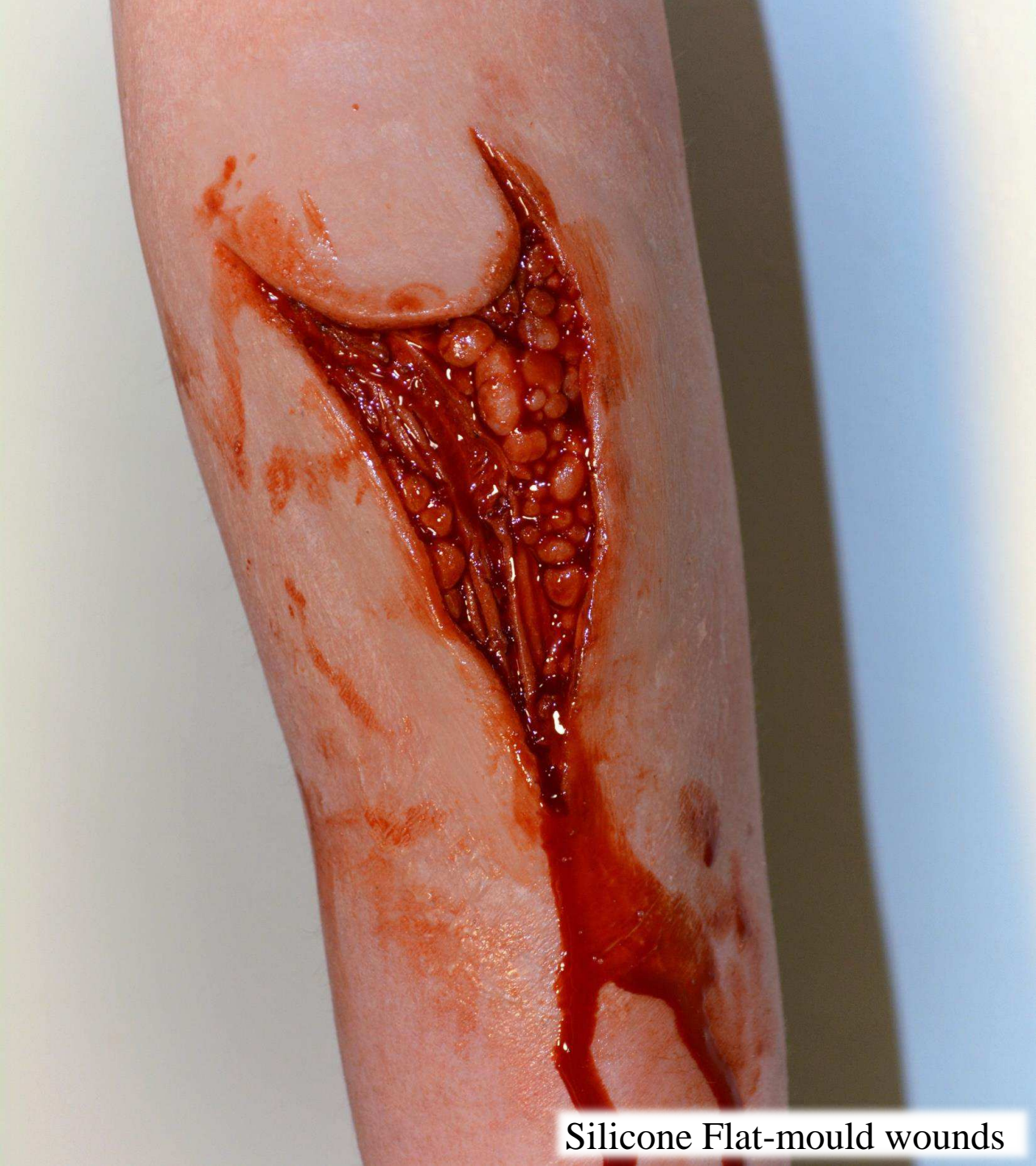
Silicone Flat-mould wounds