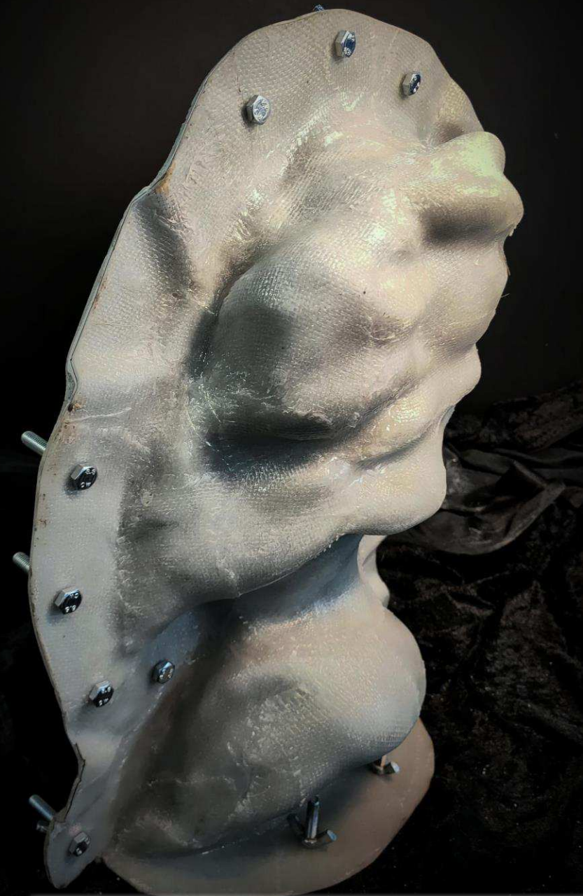
Epoxy mould with polyester corrected core.