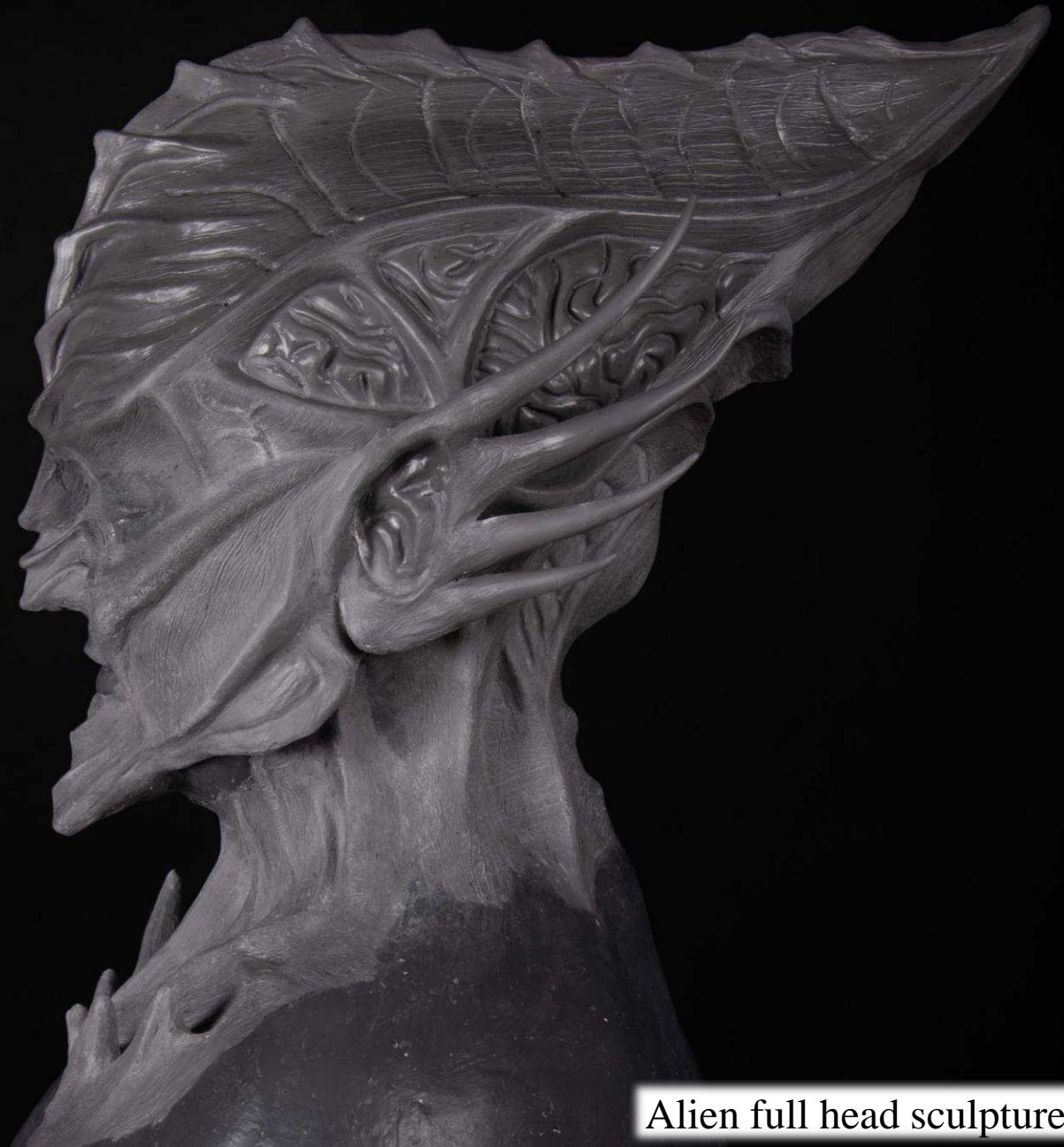
Alien full head sculpture