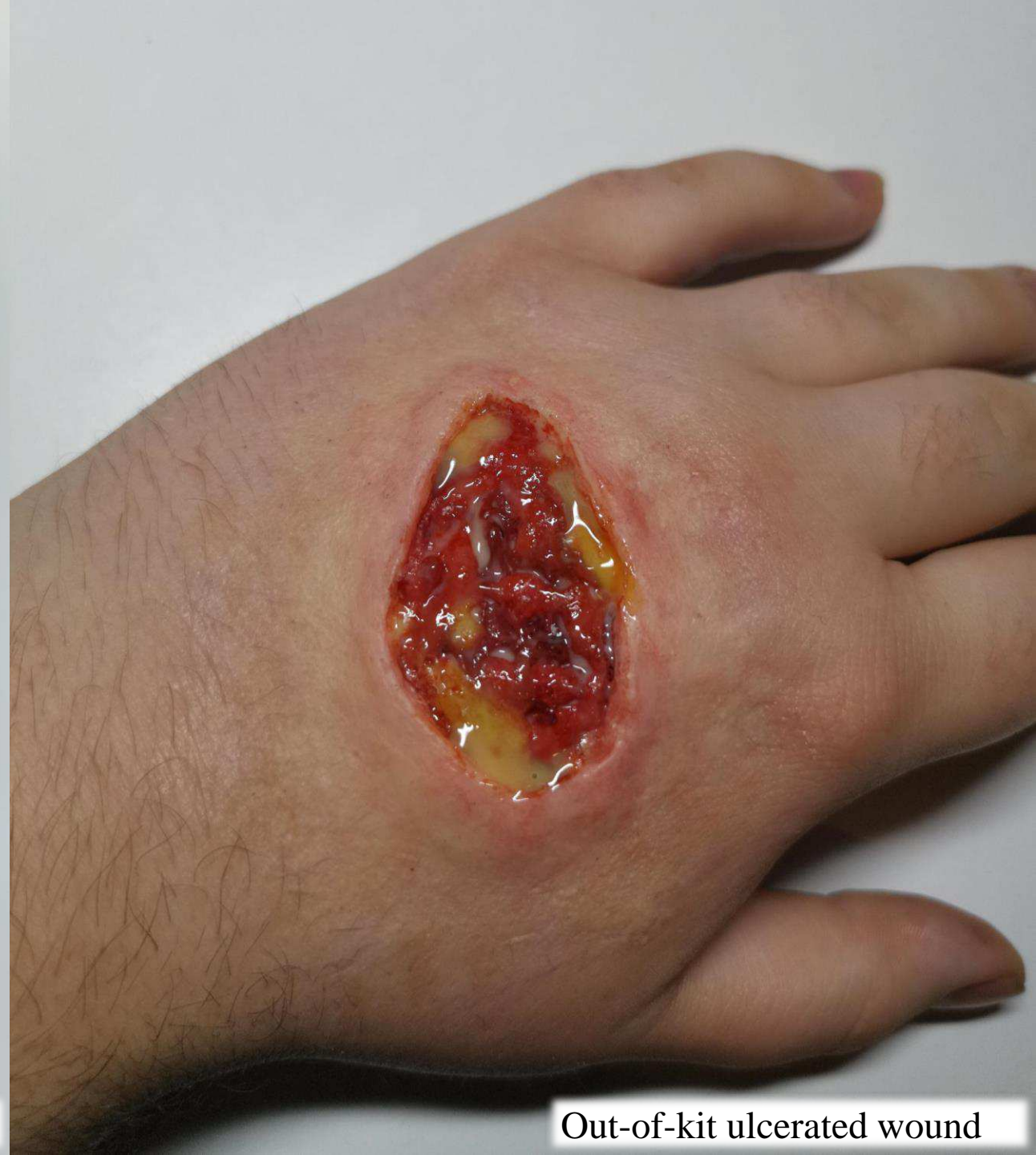
Out-of-kit ulcerated wound