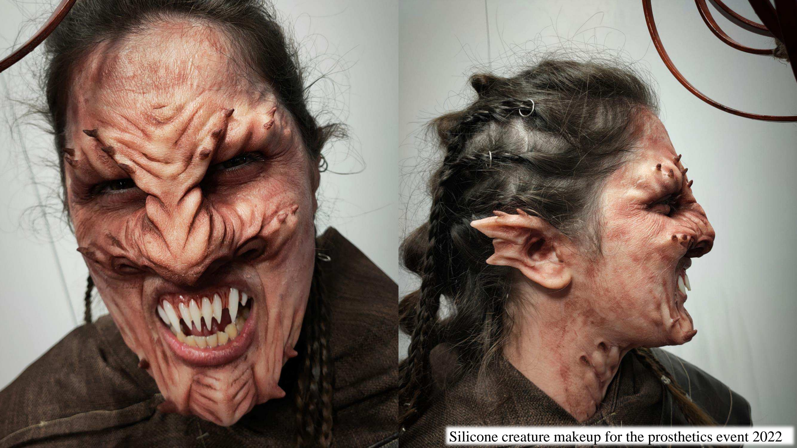
Silicone creature makeup for the prosthetics event 2022