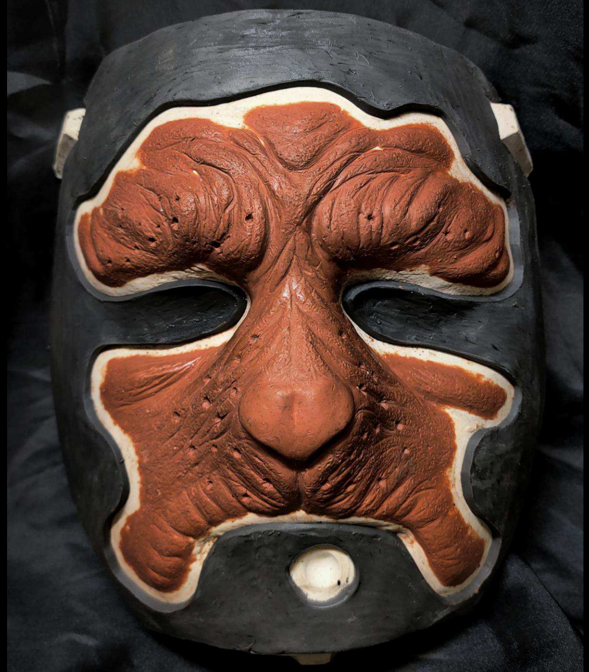
Rat prosthetic sculpture on corrected core with plasteline flashing