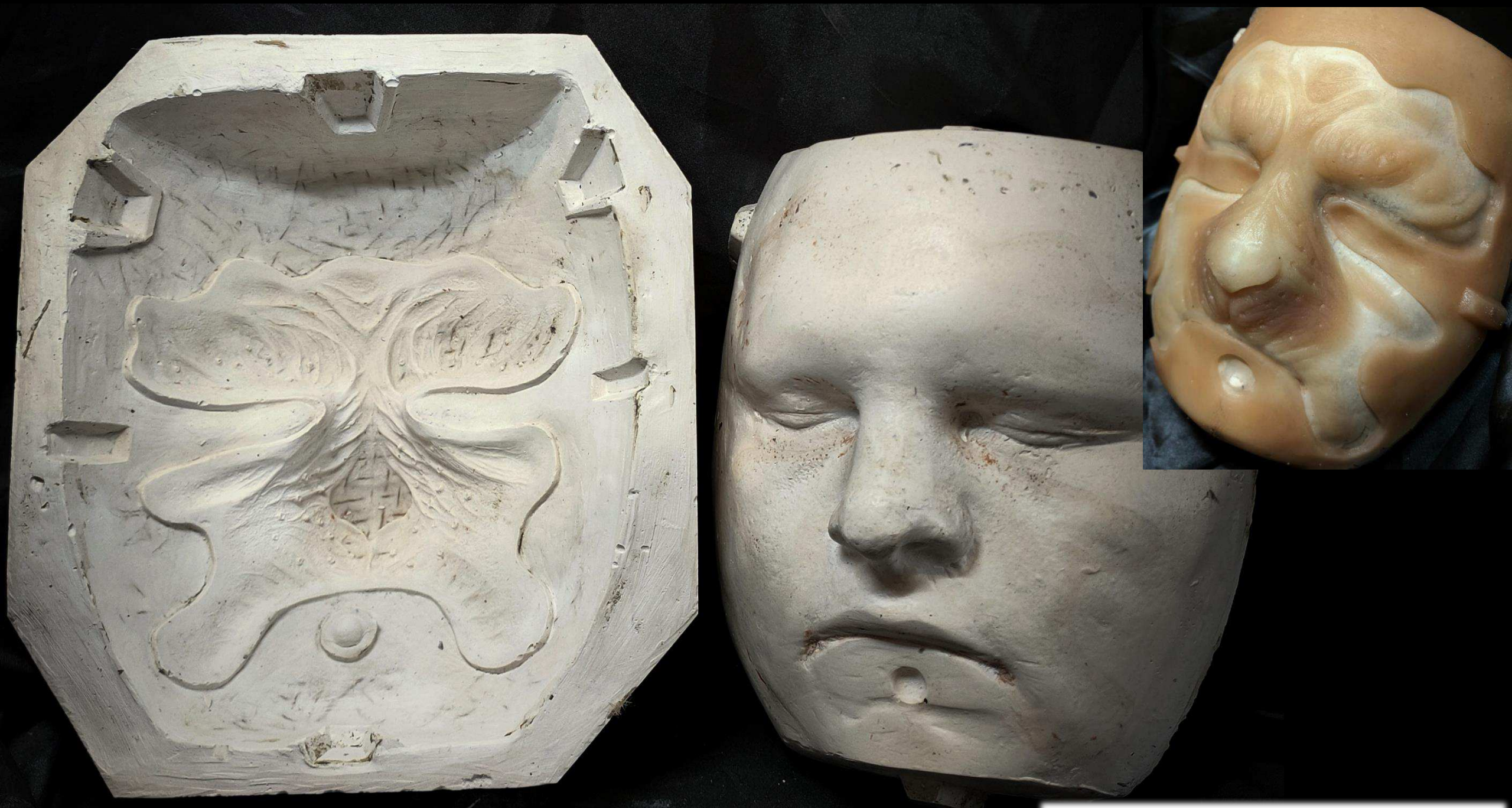
Rat prosthetic, Two part plaster mould