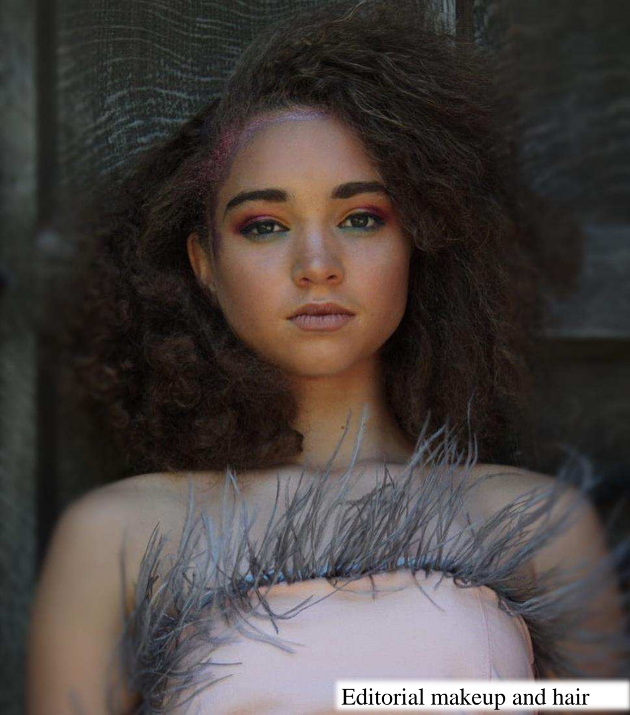
Editorial makeup and hair